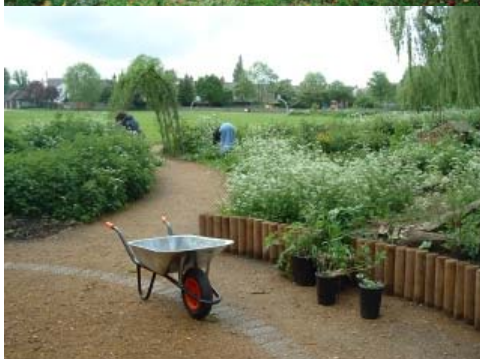
From top: the Garden in 2000 seen through the willow 'arch'; the arch as seen from the sensory garden in 2003